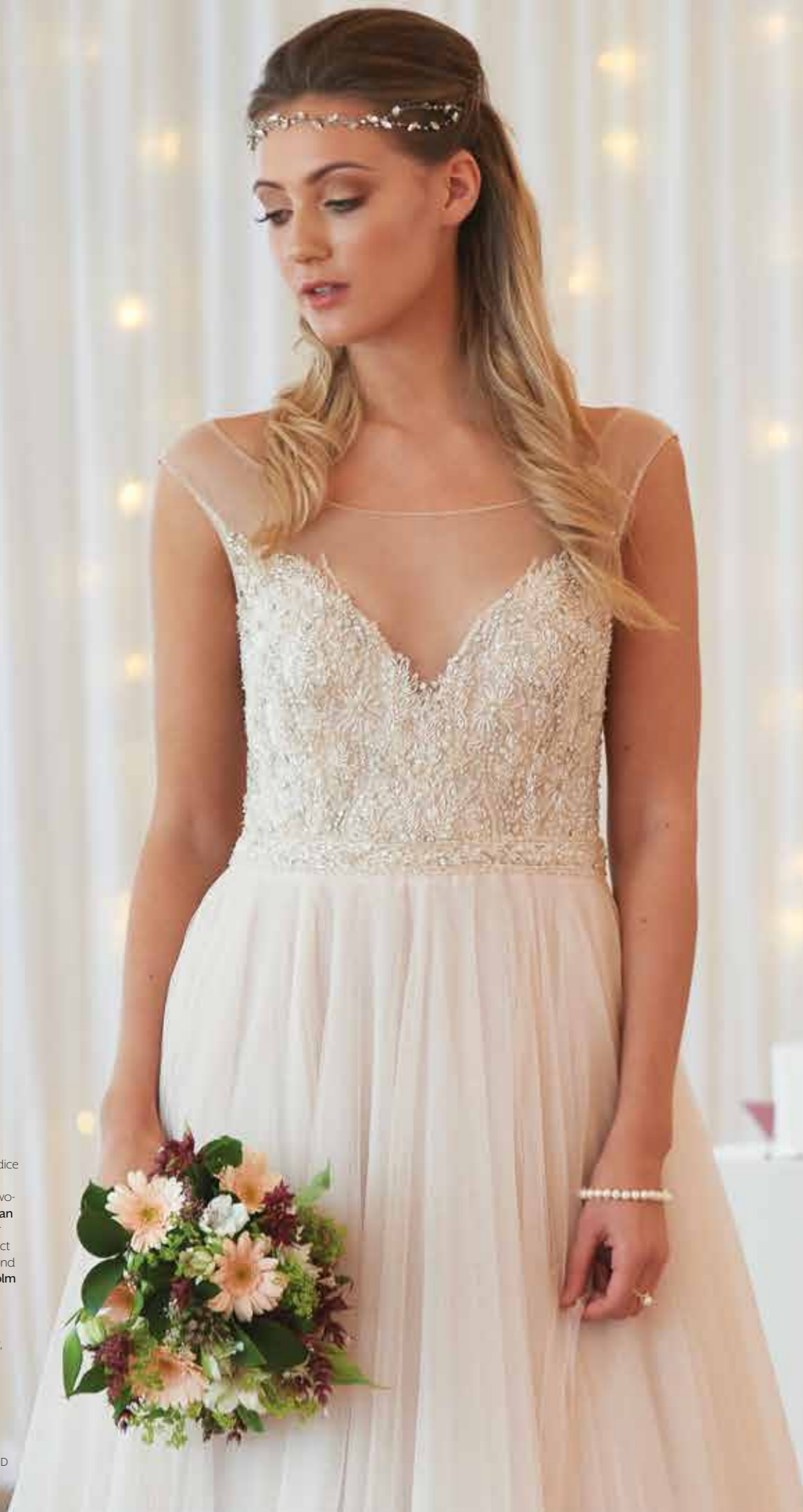
[Above] Kaliah ballerina-inspired A-line gown with plunging neckline, beaded Swarovski crystal illusion bodice and full net skirt by Watters, £2,880, and silver jewelled two-row browband, £195, both Pan Pan Bridal . White freshwater pearl 8" bracelet, £145, and 9ct two-colour pearl and diamond twist ring, £395, both Chisholm Hunter . Rustic garden posy of germini, ammi, alchemilla, alstroemeria and Himalayan honeysuckle, made to order, Borealis Flowers Stockists on page 256