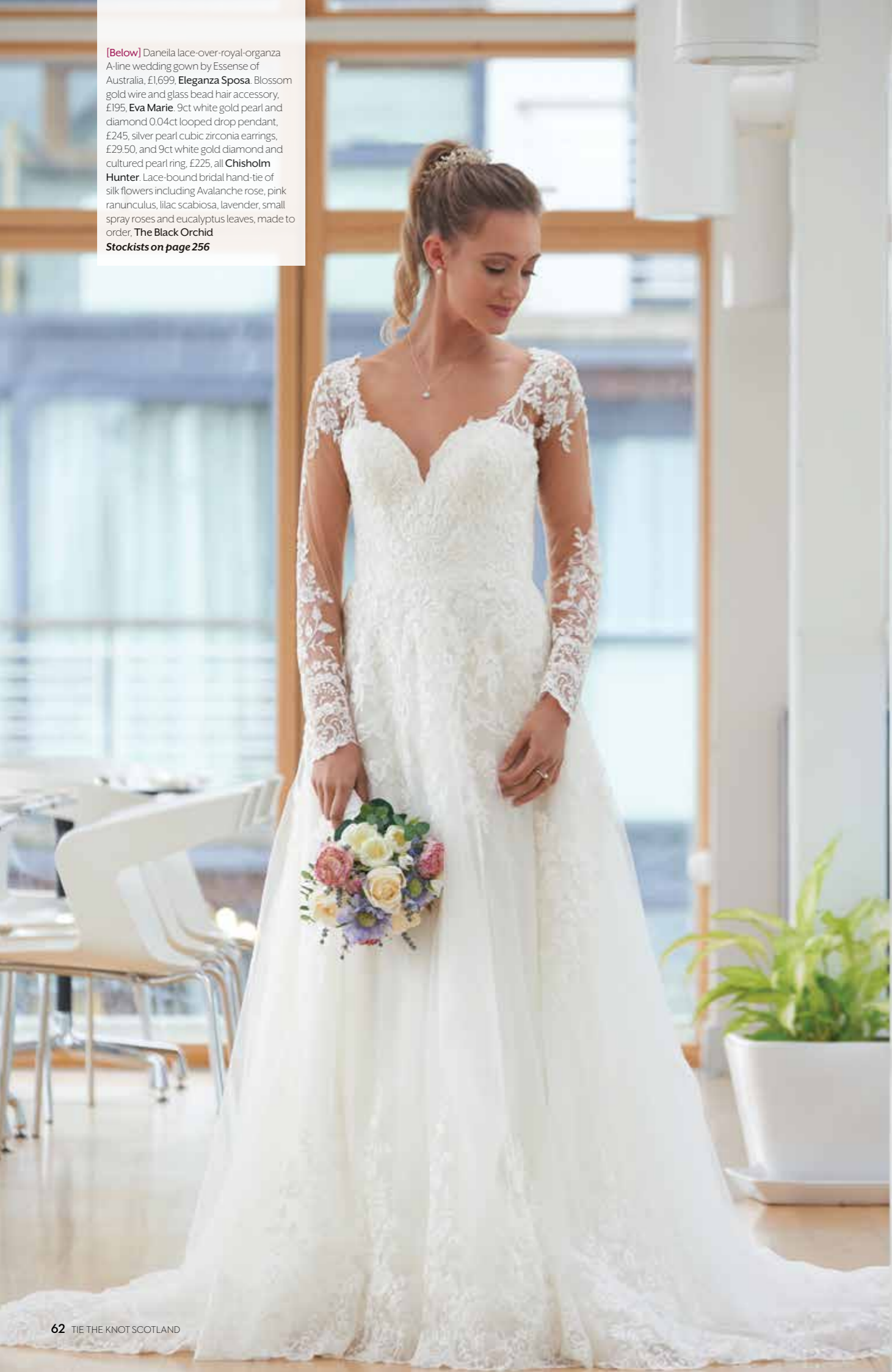
[Below] Daneila lace-over-royal-organza A-line wedding gown by Essense of Australia, £1,699. Eleganza Sposa. Blossom gold wire and glass bead hair accessory, £195. Eva Marie. 9ct white gold pearl and diamond 0.04ct looped drop pendant, £245, silver pearl cubic zirconia earrings, £29.50, and 9ct white gold diamond and cultured pearl ring, £225, all Chisholm Hunter. Lace-bound bridal hand-tie of silk flowers including Avalanche rose, pink ranunculus, lilac scabiosa, lavender, small spray roses and eucalyptus leaves, made to order, The Black Orchid Stockists on page 256