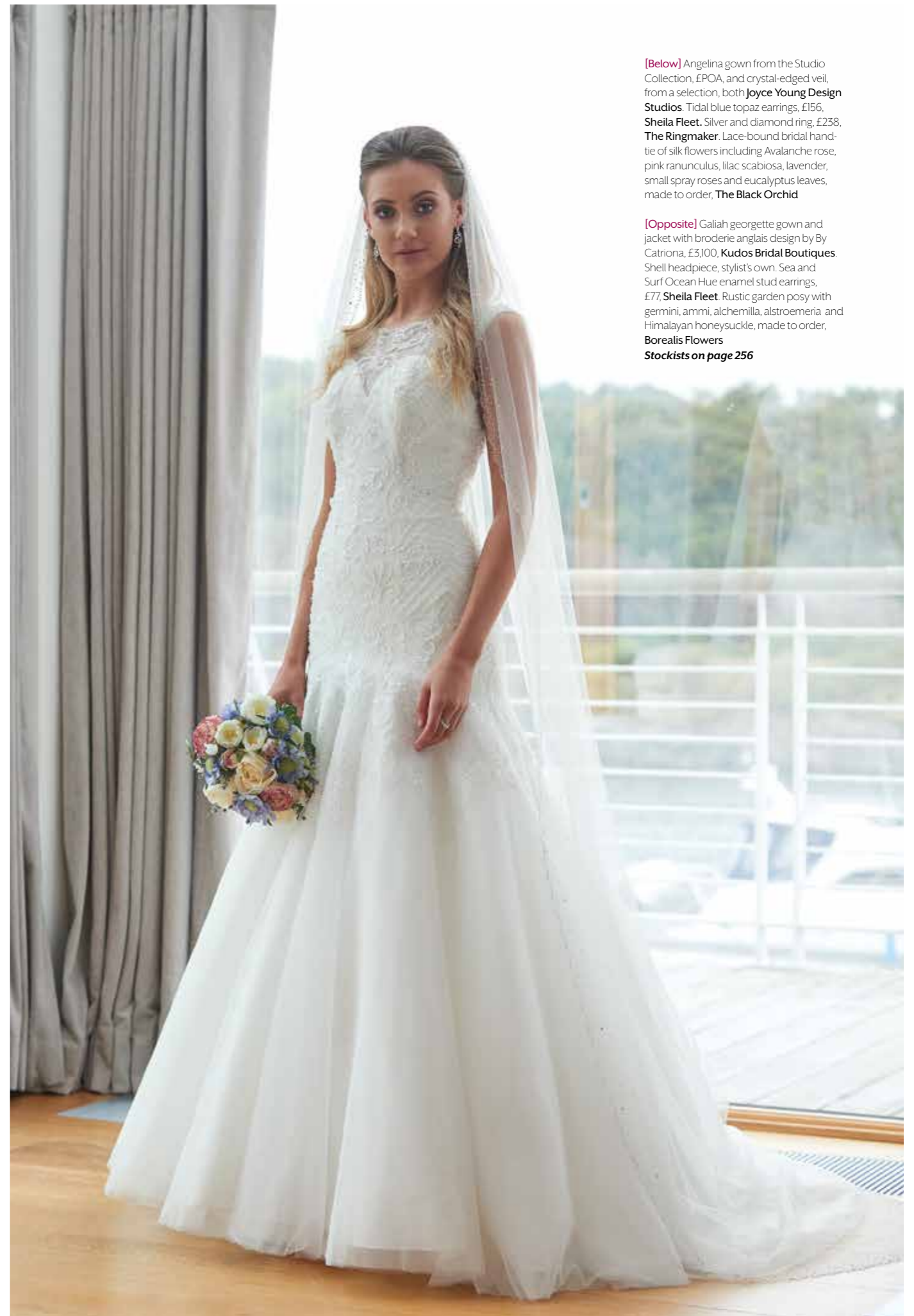
[Below] Angelina gown from the Studio Collection, £POA, and crystal-edged veil, from a selection, both Joyce Young Design Studios . Tidal blue topaz earrings, £156, Sheila Fleet . Silver and diamond ring, £238, The Ringmaker . Lace-bound bridal handle of silk flowers including Avalanche rose, pink ranunculus, lilac scabiosa, lavender, small spray roses and eucalyptus leaves, made to order, The Black Orchid