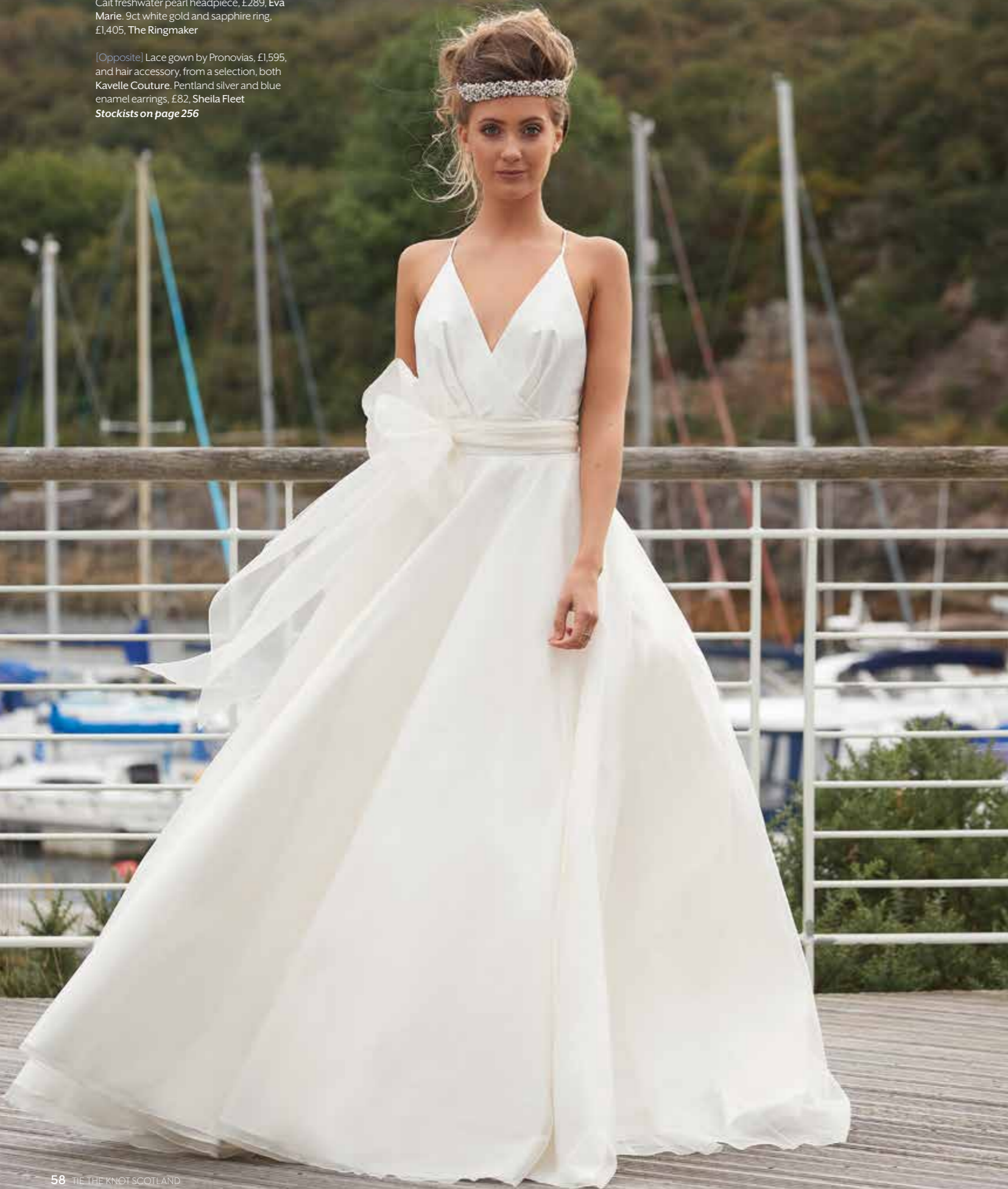
[Opposite] Lace gown by Pronovias, £1,595, and hair accessory, from a selection, both Kavelle Couture. Pentland silver and blue enamel earrings, £82, Sheila Fleet Stockists on page 256